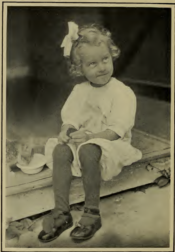
A DECLARATION OF INDEPENDENCE